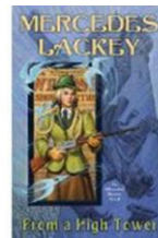
From a High Tower By: Mercedes Lackey