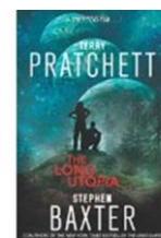
The Long Utopia By: Stephen Baxter