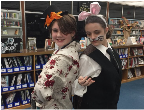
Mad Hatter & White Rabbit of Books Come Alive 2018

Over eighty people attended our second annual Books Come Alive and Local Authors Festival event. Local volunteers chose some fantastic books, and some great characters wandered the stacks. Count Olaf attempted to keep his group of orphans in line, while Max and the Wild Things had roaring contests with all the kids, and a creepy woods took over the adult stacks, where participants witnessed a scene from the Watchers. Tune in next fall to see all the places we will go.