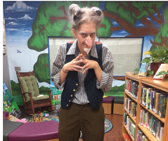
Count Olaf of Books Come Alive 2018