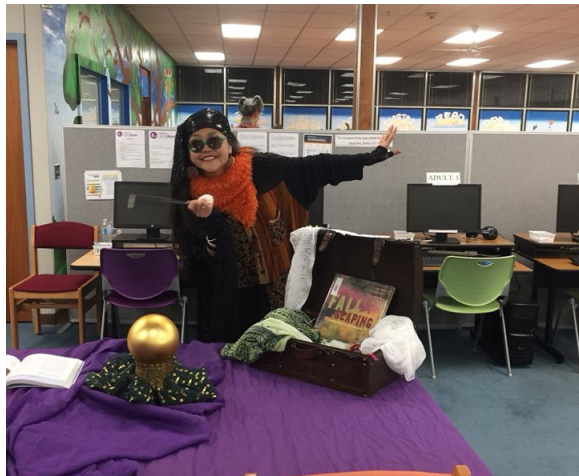
Professor Trelawney of Books Come Alive 2018